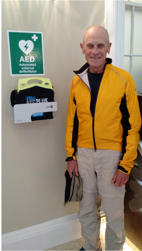
Royal Bank of Scotland