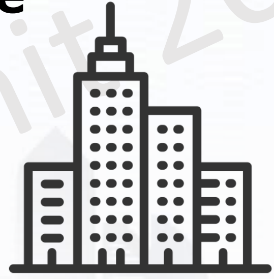
33 Residential Towers (500+ft)